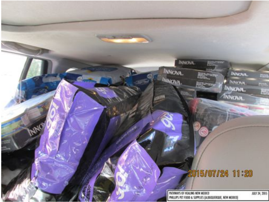
PATHWAYS OF HEALING NEW MEXICO PHILLIPS PET FOOD & SUPPLIES (ALBUQUERQUE, NEW MEXICO) JULY 24, 2015