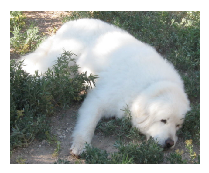
1 dog (MOLLY) taken to Rehabilitation Center of Albuquerque for therapy dog training Cochiti Lake New Mexico --> Albuquerque New Mexico Sue Kinzie Miles: 98