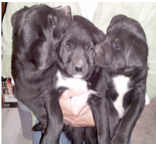
3 BLACK LAB PUPPIES

Cochiti Lake New Mexico --> Eldorado New Mexico Sue Kinzie (79 miles)